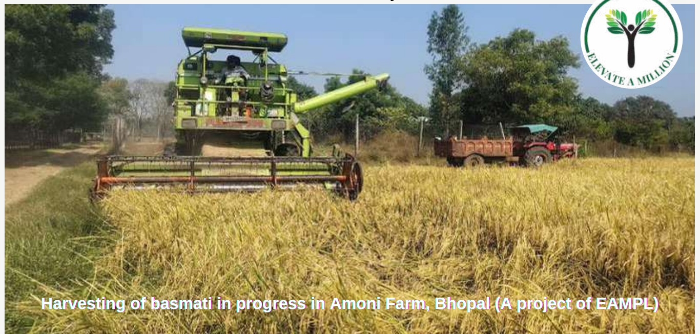
Harvesting of basmati in progress in Amoni Farm, Bhopal (A project of EAMPL)

EAMPL builds a transparent "farm-to-fork" chain using digital farm diaries and QR-coded traceability, giving consumers full visibility into the food they purchase.