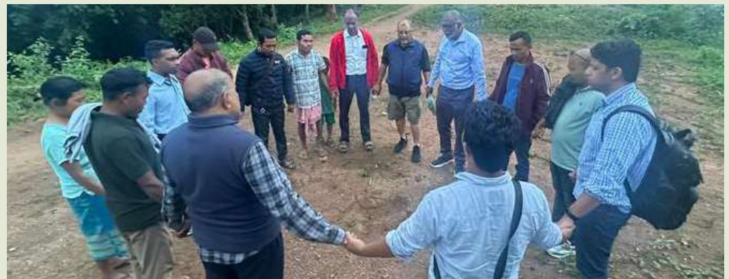
The Villagers of Mengochigre in North Garo Hills generously donated a new plot of land to establish a Village Knowledge Centre. This initiative was officially dedicated on October 25, 2024, by the P R Baby Foundation team, who visited Garo Hills during that month. These centers serve as vital hubs for providing access to essential information, technology, and resources that cater to villagers' diverse needs. They offer support in areas such as agriculture, health, education, and livelihoods, aiming to empower the local community and enhance their overall well-being.