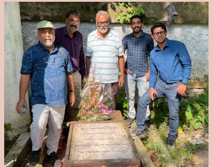
Burial Site of Dr. William Carey